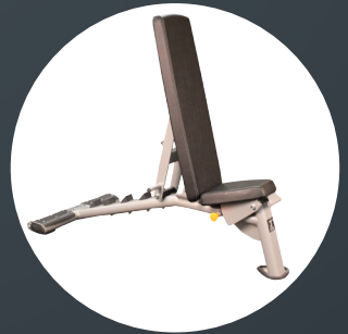
75° Incline (Decline seat)