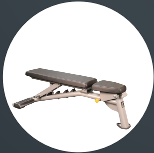
Flat Position (Flat seat)