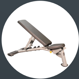
30° Incline (Decline seat)