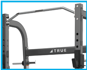
Chrome-plated, knurled, multi-position chin up bar