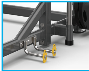
Available with optional band pegs